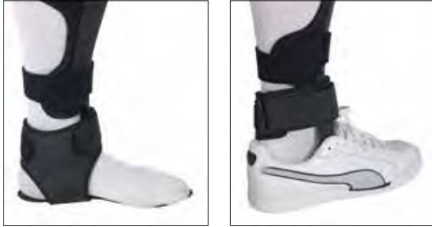
For Pes Valgus Control